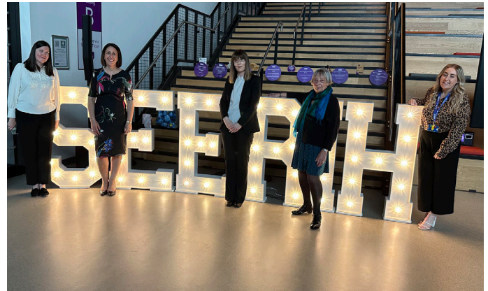
p5 - Celebrating a Remarkable Partnership