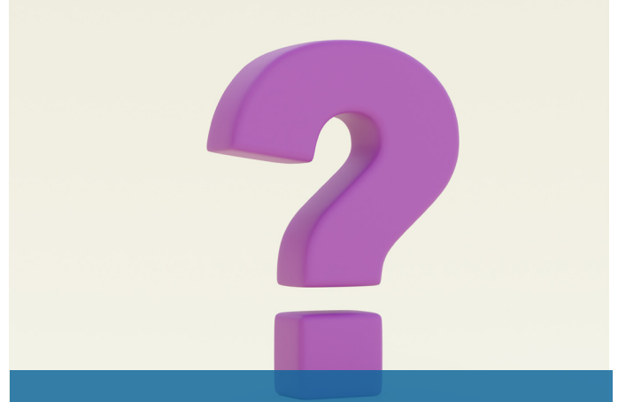
p4 - 2025 Show Announced