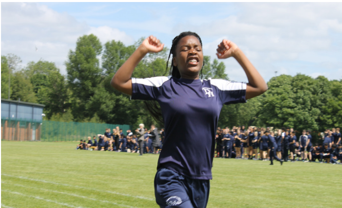
p10-11 - Sports Day