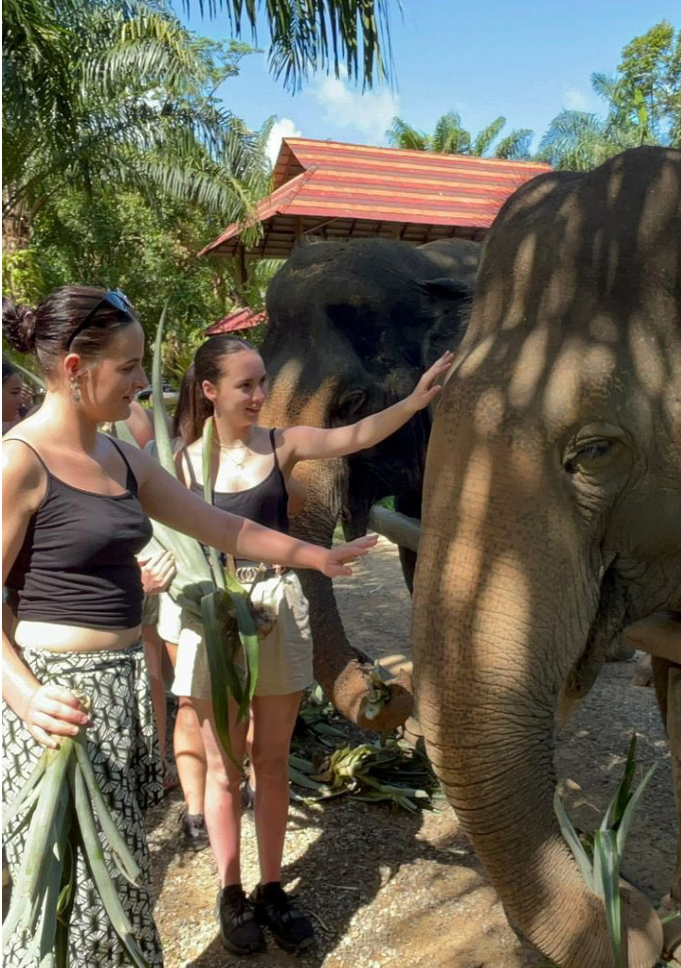
p7-8 - International Changemakers