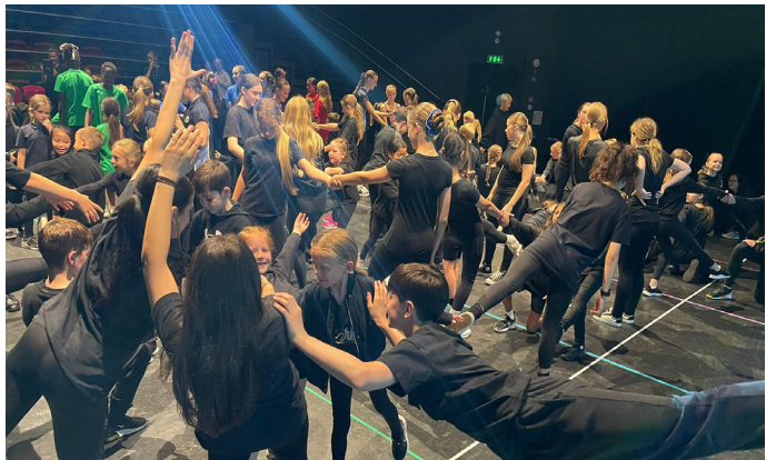
p2-3 - A Thrilling Collaboration